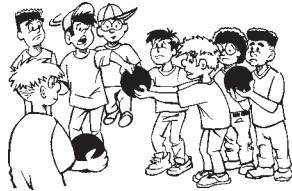
Juniors (ages 8 & up)