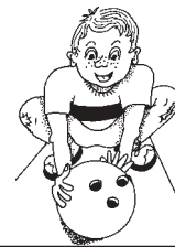
Bumpers (ages 3 - 7)

We cordially invite you and your friends to join one of our bowling leagues. Openings are available for team, couples, individuals, groups, organizations and company leagues. If the day and time inside are not suitable for your schedule, please tell us and we may be able to start a league that does fit your schedule.